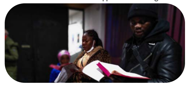
New Year's Eve (Saturday 31 December) New Year's Eve joint service with Philippus Please check our Website/App for the starting time